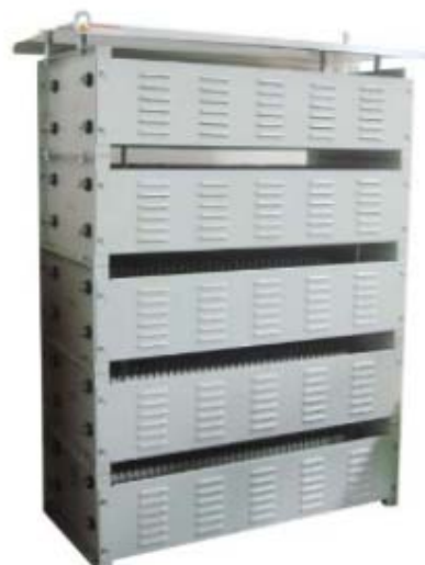
Dump load box