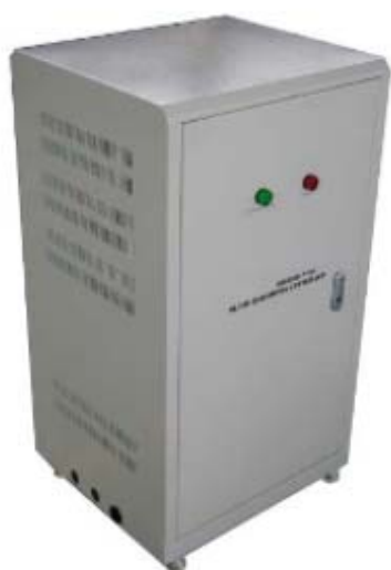
Rectifier/Dump load controller

Metal box design of the dump load radiates the heat of the resistance inside quickly via the air convection. So there is no need for an extra fan.